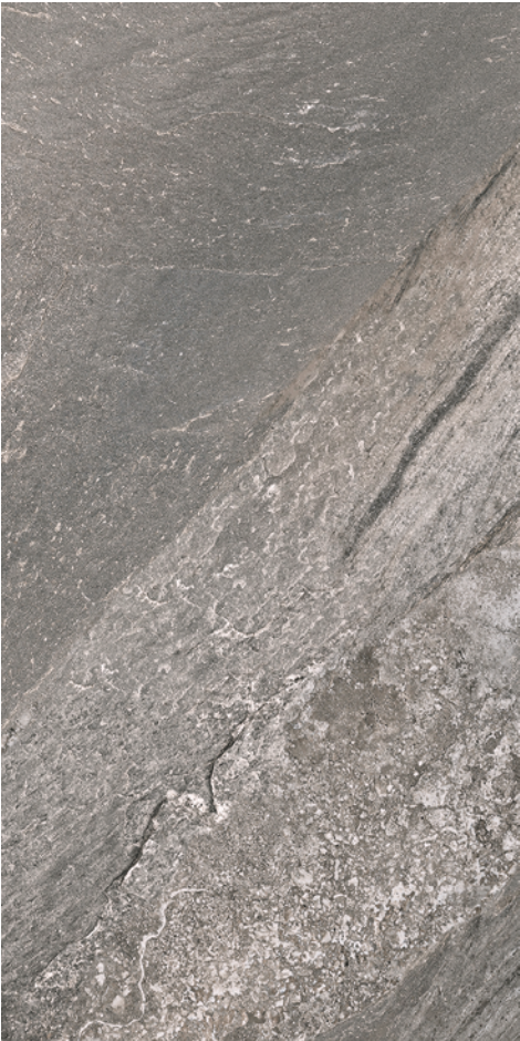
12" x 24"