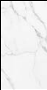
24"x48" Glossy RECTIFIED EDGE